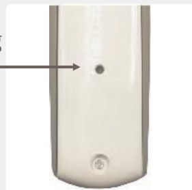
Back view of Remote